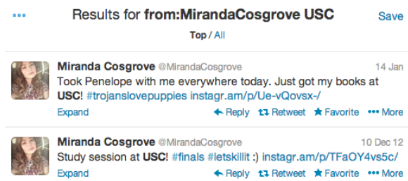
Figure 2: Example of fetching tweets containing entity USC mention from Miranda Cosgrove (an American actress and singer-songwriter)’s twitter stream.

We now describe the generation of our distantly supervised training dataset in detail. We make use of Google Plus and Freebase to obtain ground facts and extract positive/negative bags of postings from users’ twitter streams according to the ground facts.